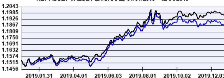
NET ASSET VALUE PER SHARE, 01/01/2019 - 12/31/2019

— Aegon Polish Bond Fund P series — Benchmark