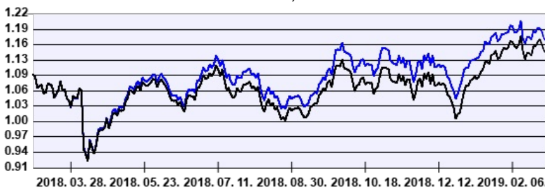
NET ASSET VALUE PER SHARE, 03/01/2018 - 02/28/2019

— Aegon Russia Equity Fund PLN series — Benchmark