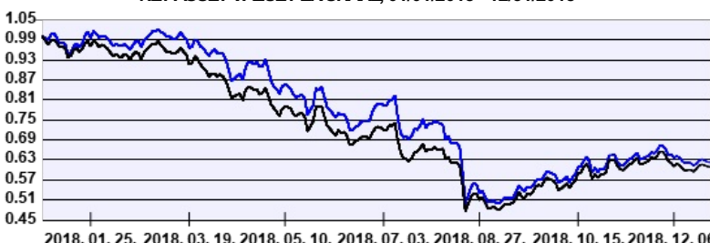
NET ASSET VALUE PER SHARE, 01/01/2018 - 12/31/2018

— Aegon Istanbul Equity Fund PLN series — Benchmark