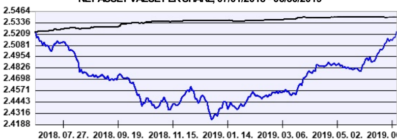
NET ASSET VALUE PER SHARE, 07/01/2018 - 06/30/2019

— Aegon Alfa Total Return Investment Fund PLN series — Benchmark Past performance is no guarantee of future results. This report should not be considered as an offer or investment advisory. The Fund Prospectus contains the detailed conditions of the investment. The distribution costs of the fund purchase can be found at the distributors.