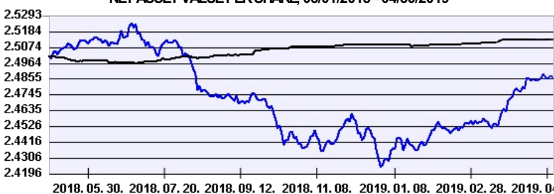
NET ASSET VALUE PER SHARE, 05/01/2018 - 04/30/2019

Past performance is no guarantee of future results. This report should not be considered as an offer or investment advisory. The Fund Prospectus contains the detailed conditions of the investment. The distribution costs of the fund purchase can be found at the distributors.