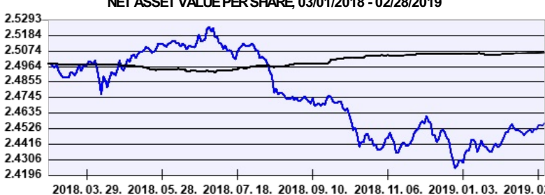
NET ASSET VALUE PER SHARE, 03/01/2018 - 02/28/2019

— Aegon Alfa Total Return Investment Fund PLN series — Benchmark