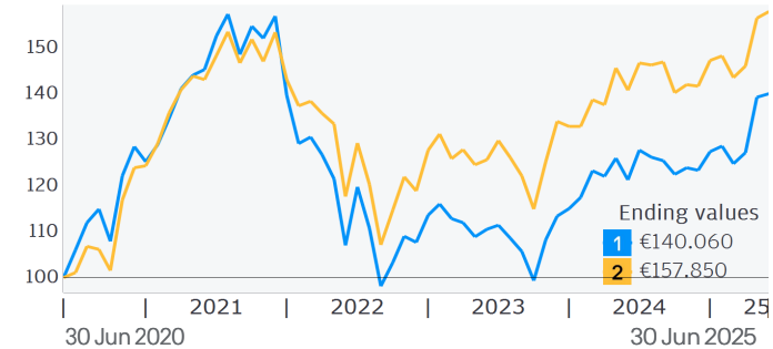
Calendar Year Performance (%)