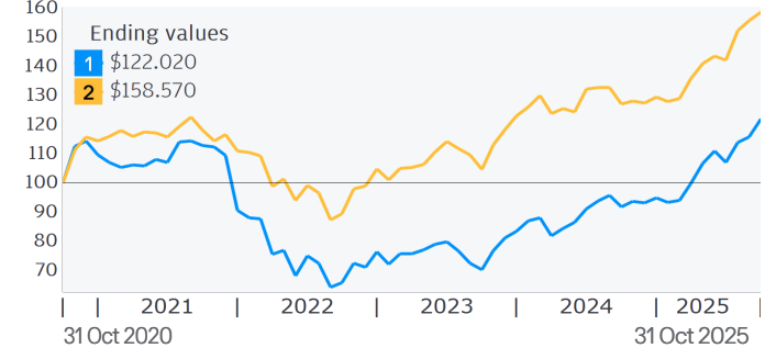
Calendar Year Performance (%)