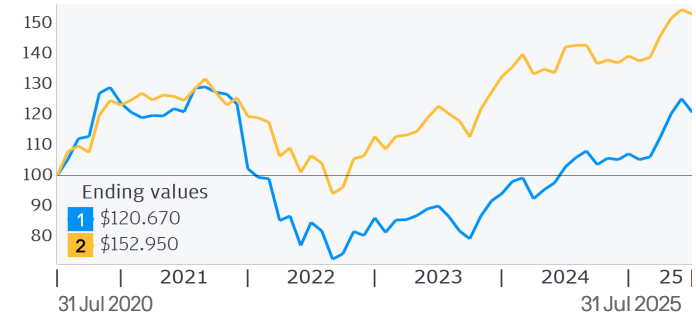
Calendar Year Performance (%)