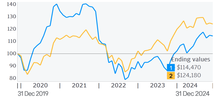
Calendar Year Performance (%)