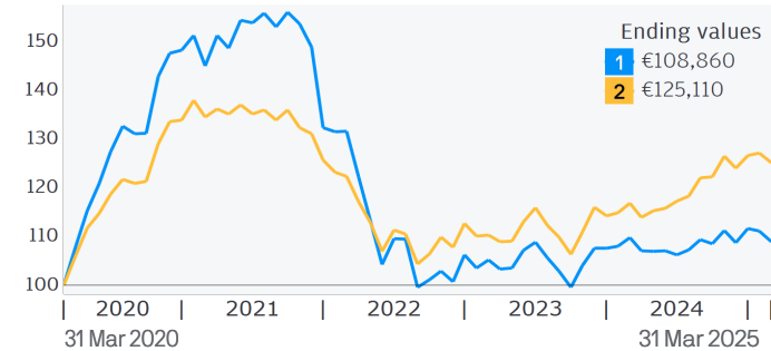
Growth of EUR 100,000 Calendar years