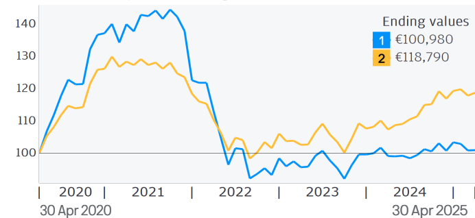
Growth of EUR 100,000 Calendar years