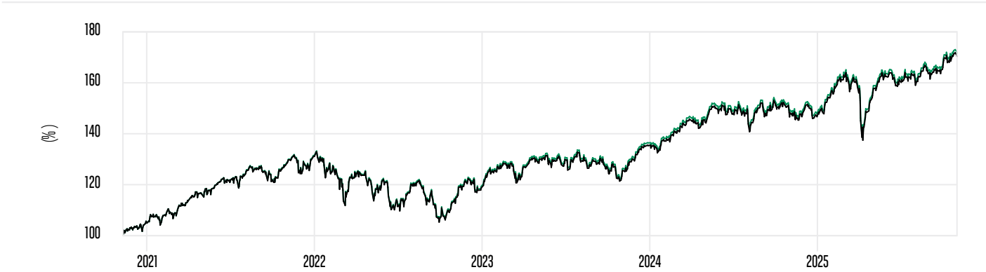
Cumulated Performance at 31.10.2025 (%)

The benchmark indicator is the Stoxx Europe 600, published in EUR by Stoxx Limited. The Stoxx Europe 600 index is composed of stocks for European companies of all sizes. The index includes 600 stocks (200 "big caps", 200 "midcaps", 200 "small caps"). Stock picking is carried out according to market capitalisation. The index is subject to revision each quarter and includes the dividends generated by the equities comprising it. Its Bloomberg code is <sxxr> Index.</sxxr>