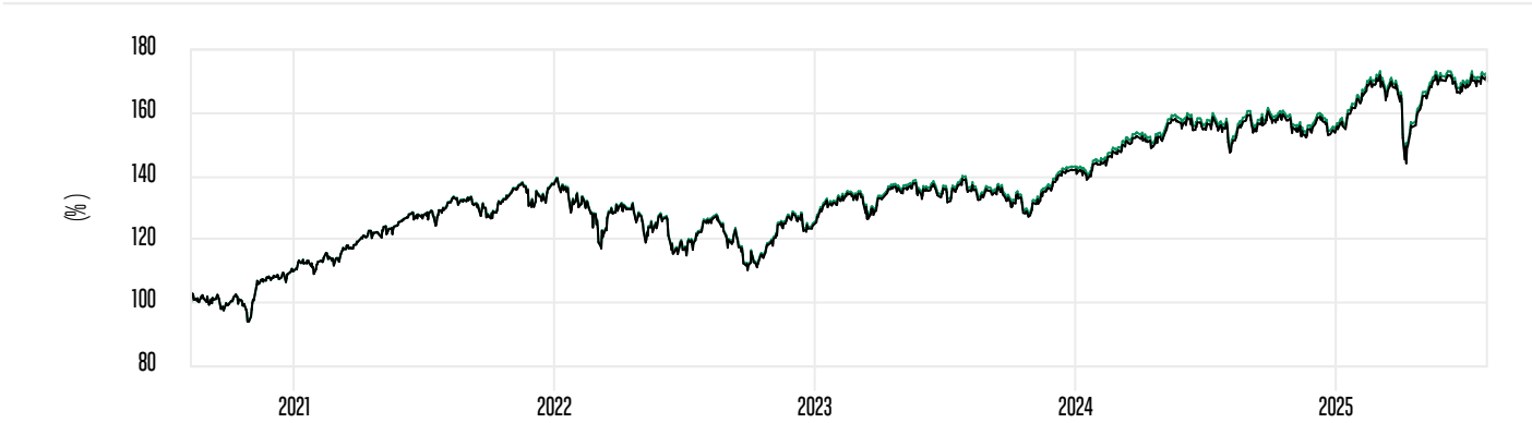
Cumulated Performance at 31.07.2025 (%)

The benchmark indicator is the Stoxx Europe 600, published in EUR by Stoxx Limited. The Stoxx Europe 600 index is composed of stocks for European companies of all sizes. The index includes 600 stocks (200 "big caps", 200 "midcaps", 200 "small caps"). Stock picking is carried out according to market capitalisation. The index is subject to revision each quarter and includes the dividends generated by the equities comprising it. Its Bloomberg code is <sxxr> Index.</sxxr>