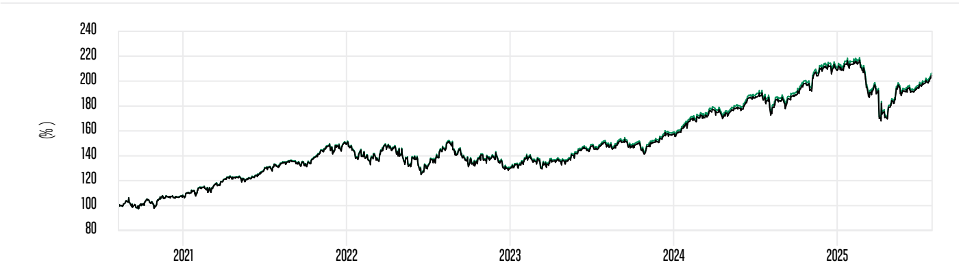
Cumulated Performance at 31.07.2025 (%)

The benchmark indicator is the S&P 500, published in USD by Standard & Poor's. The S&P 500 is an index composed of the 500 largest US companies. The selected stocks represent the highest market capitalisations and cover some 75% of US corporate equities. The index was created by S&P in 1957 and includes the dividends generated by the equities comprising it. Its Bloomberg code is SPTR500N Index.