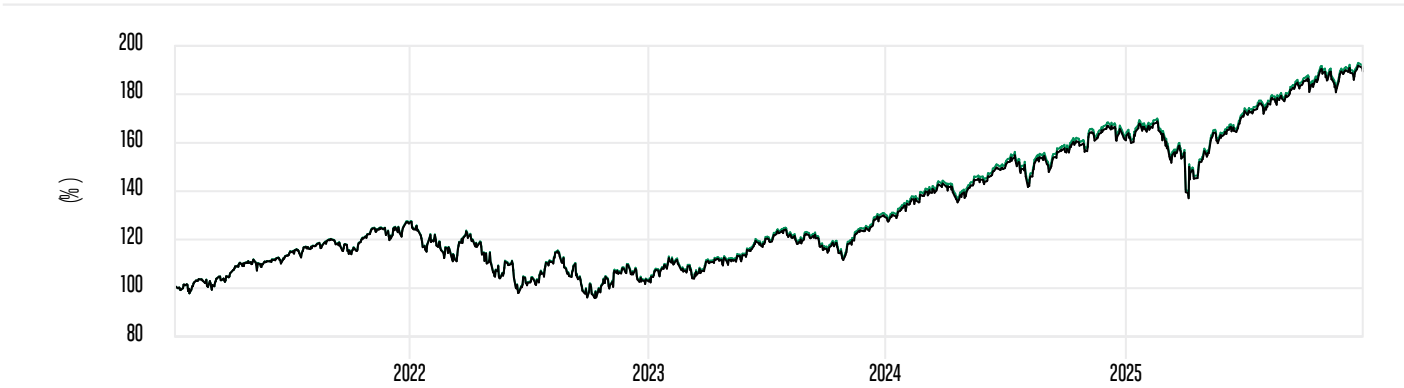
Cumulative performance at 31.12.2025 (%)

The benchmark indicator is the S&P 500, published in USD by Standard & Poor's. The S&P 500 is an index composed of the 500 largest US companies. The selected stocks represent the highest market capitalisations and cover some 75% of US corporate equities. The index was created by S&P in 1957 and includes the dividends generated by the equities comprising it. Its Bloomberg code is SPTR500N Index.