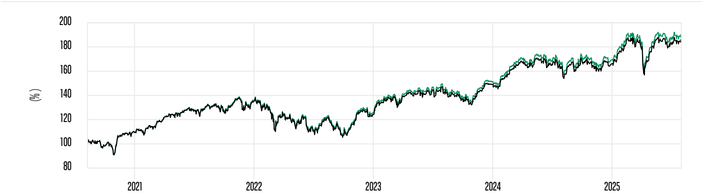
Cumulated Performance at 31.07.2025 (%)

This index is composed of the leading 50 companies in the euro zone, selected according to their market capitalisation, trading volumes and business sector. The index is weighted by country and by sector to reflect as closely as possible the economic structure of the euro zone. Due to its breadth and representative nature, the Euro Stoxx 50® has become the benchmark index for investors seeking to benefit from the growth prospects of euro zone equity markets.