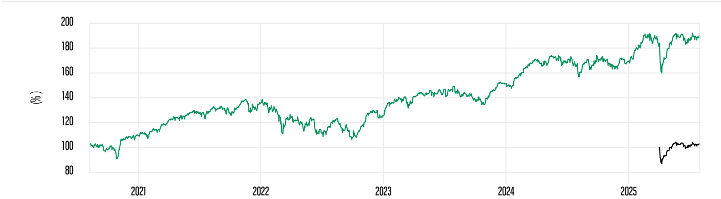
Cumulated Performance at 31.07.2025 (%)

This index is composed of the leading 50 companies in the euro zone, selected according to their market capitalisation, trading volumes and business sector. The index is weighted by country and by sector to reflect as closely as possible the economic structure of the euro zone. Due to its breadth and representative nature, the Euro Stoxx 50® has become the benchmark index for investors seeking to benefit from the growth prospects of euro zone equity markets.