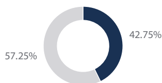
Top 10 Holdings as % of Total

Top 10 holdings as a percentage of Total Net Assets. Portfolio Holdings are subject to change at any time. References to specific securities should not be construed as a recommendation to buy or sell and should not be assumed profitable.