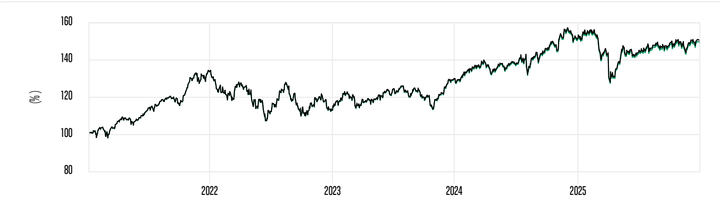
Cumulative performance at 31.12.2025 (%)