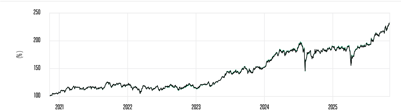
Cumulated Performance at 31.10.2025 (%)

The Index is composed of Japanese companies selected on the basis of Environmental, Social and Corporate Governance (ESG) criteria (such as environmental opportunity, pollution and waste, human capital, corporate governance, etc.) and based on their efforts to reduce their exposure to coal and unconventional fossil fuels, while minimising the tracking error compared to the parent index, the MSCI Japan index. As a result, companies involved in sectors with a potentially high negative ESG impact, those subject to significant violations of the UN Global Compact principles and those involved in severe ESG-related controversies are excluded from the Index. The type of approach used here is Best-in-universe (type of ESG selection consisting of giving priority to the issuers best rated from a non-financial viewpoint irrespective of their sector of activity, and accepting sector biases, because the sectors which are considered more virtuous on the whole will be more heavily represented). The extra-financial strategy of the Index, carried out at each step of the investment process, may comprise methodological limitations such as the risk related to ESG investment or the Index rebalancing. Further information on the Index, its composition, calculation and rules for periodical review and rebalancing and on the general methodology behind the MSCI indices can be found on www.msci.com . The Comparison Index is the MSCI Japan (USD) NR